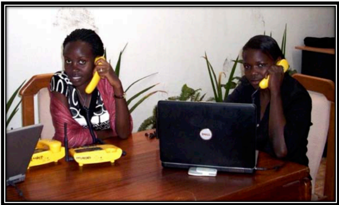
Open Mind Operators answering agriculture calls in Kampala from villagers in rural Uganda

A request for support to build a unique, comprehensive toolkit enabling organizations worldwide to set up & run telephone hotlines in their communities.